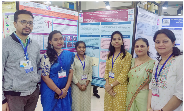
The ICMR-NIRRH study team presenting at the International Conference on Kaleidoscopic insights into Reproductive and Child Health

International Conference on Kaleidoscopic Insights into Reproductive and Child Health (23-25 Jan 2023): 'Health system's response to Family Planning services during COVID-19: A Rapid Assessment Survey in a district of Maharashtra, India'.