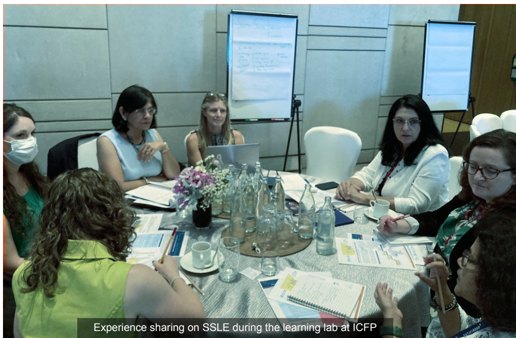
Experience sharing on SSLE during the learning lab at ICFP

The WHO/IBP network held a pre-conference session in collaboration with UNFPA and FHI 360 on 13 November 2022. WHO facilitated a learning lab on the South - South learning exchange. Participants from Knowledge success, Intrahealth International, Pathfinder International, Voluntary Service Overseas International, UNFPA and FIGO attended this round table discussion and exchanged their experiences and lessons learnt on SSLE.