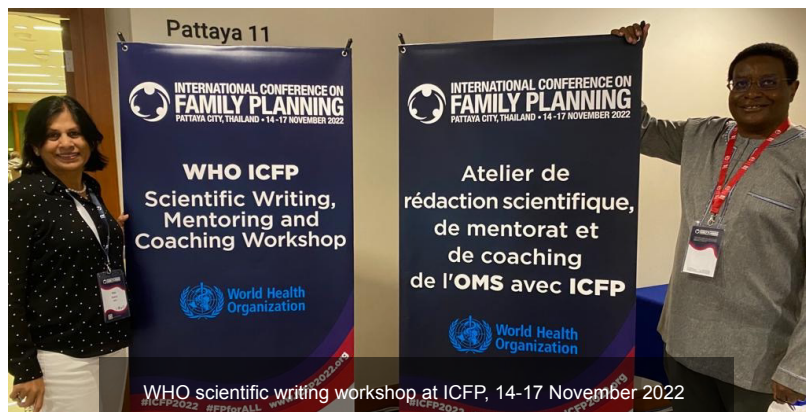
WHO scientific writing workshop at ICFP, 14-17 November 2022