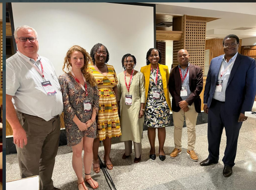
The CAPSAI Study team at ICFP