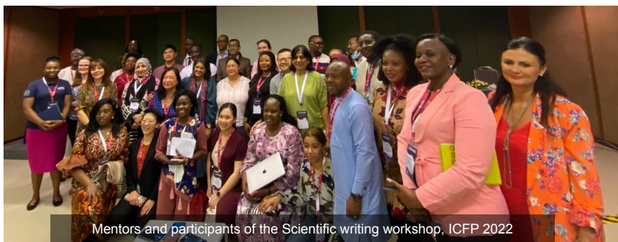
Mentors and participants of the Scientific writing workshop, ICFP 2022

A four-day (14-17 November 2022) scientific writing, mentoring and coaching workshop was organized by WHO at ICFP in collaboration with the John Hopkins Bloomberg School of Public Health. 100 participants were selected from those who submitted an abstract to ICFP to develop skills and confidence. Each session included brief lectures by experts, followed by a panel discussion. On the last day of the course, feedback was taken from the participants. In collaboration with GFMER, participants will be supported by a coaching program for 6 months and evaluated after 1 year. The recording from these sessions is available: Anatomy of a scientific paper , Getting your paper noticed by Journal editors and The road to publication .