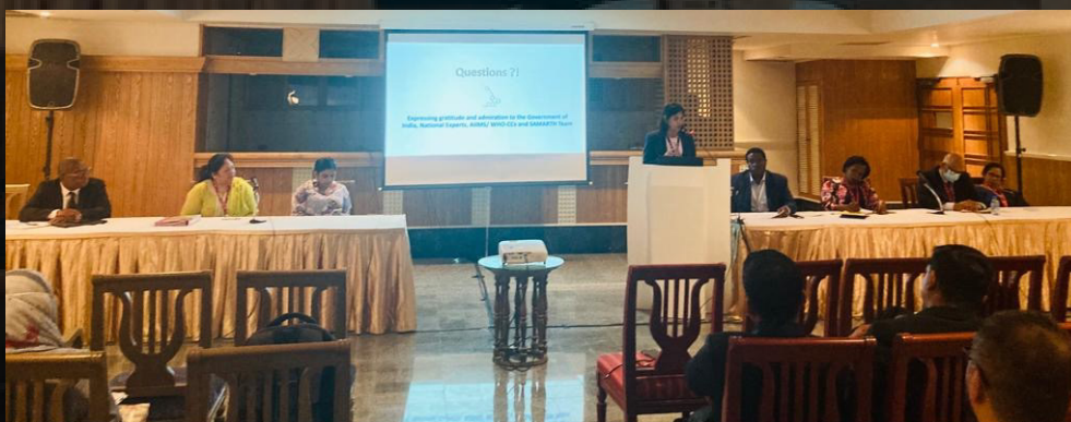
Panel discussion at ICFP 2022, Pattaya, with representatives from MoH Nigeria, Nepal, Sri Lanka, Jhpiego Uganda and WHO India