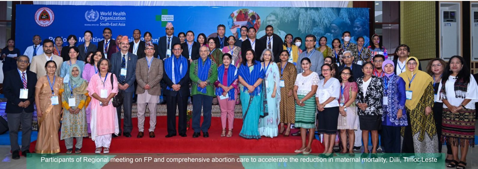
Participants of Regional meeting on FP and comprehensive abortion care to accelerate the reduction in maternal mortality, Dilli, Timor-Leste

Ministry of Health hosted a regional meeting with WHO in Dilli, Timor-Leste, from 30 November to 2 December to strengthen the capacity of Member States to implement strategies to reduce the maternal mortality ratio by improving the quality and coverage of family planning and comprehensive abortion services. The meeting was inaugurated by the HE President of the Democratic Republic of Timor-Leste, Dr Jose Ramos Horta. The meeting was attended by the Health Minister and 77 participants, including religious leaders. At the end of the meeting, each participating country developed an action plan to implement new evidence in improving access to FP, infertility, comprehensive abortion care, and post-abortion care services, including mitigation plans during health emergencies.