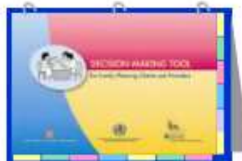
Decision-Making Tool (to be updated)