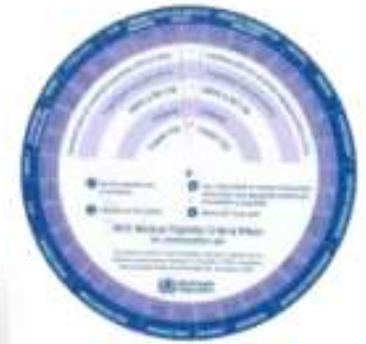
The Medical Eligibility Criteria (MEC) Wheel