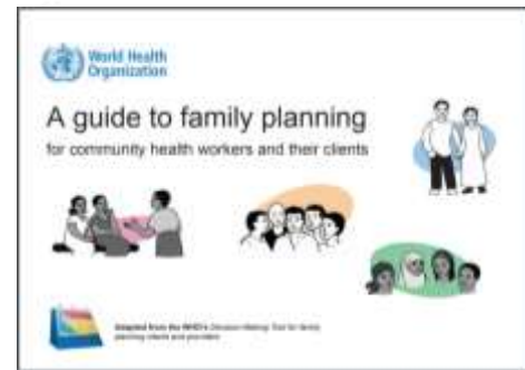
Guide to family planning for community health care providers and their clients