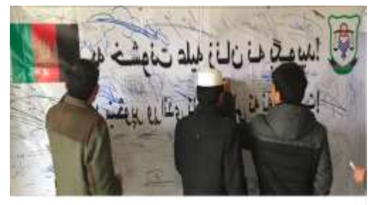
(4) Local ownership helped ensure the sustainability and success of the campaign.

(1) By signing a symbolic pledge banner, students affirmed their commitment to say 'NO' to violence against women.