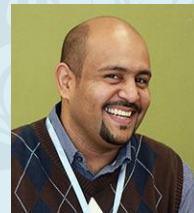
Sudan - Khalifa Elmusharaf