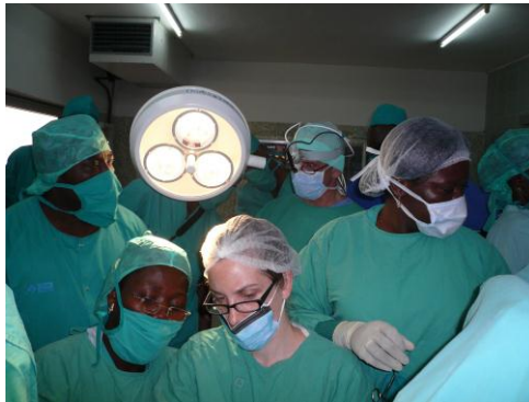
FVV surgical session in Tanguieta

The aim of this project is to disseminate the course to a larger audience, to other countries and settings. The clinically integrated e-learning approach is planned to be scaled up without major investment at teaching institutions worldwide.